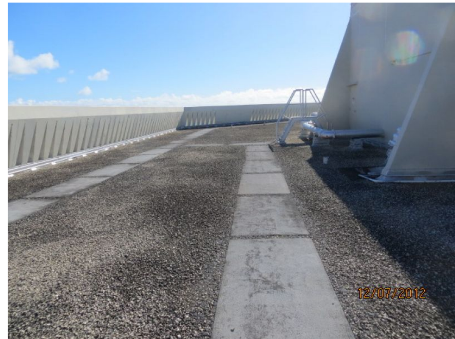
Built-Up Tar & Gravel Roof Covering