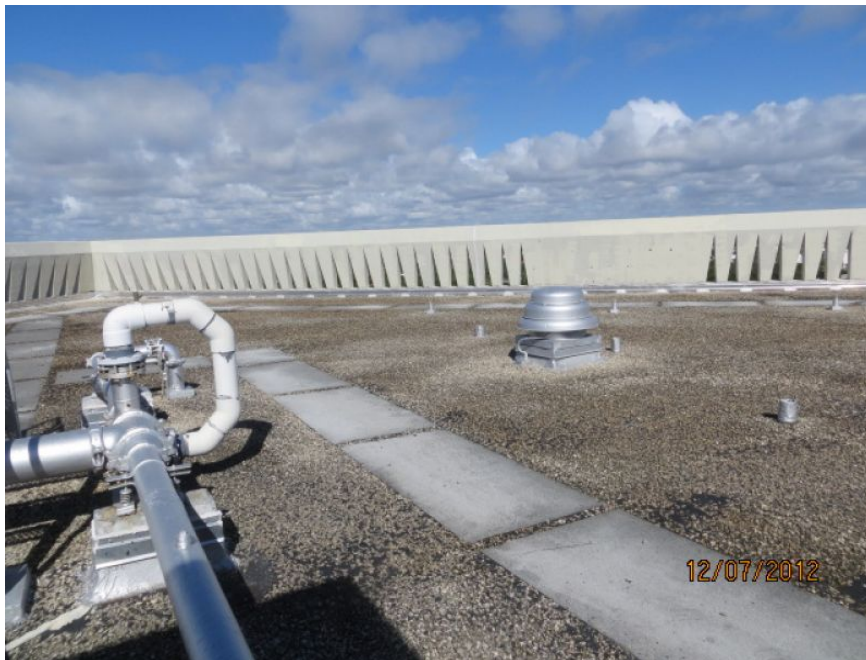
Built-Up Tar & Gravel Roof Covering