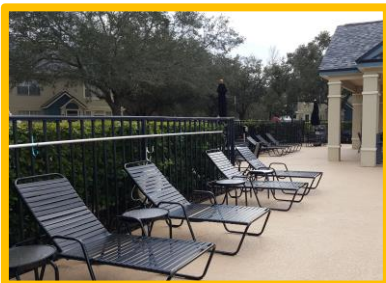
PHASE II Pool Furniture